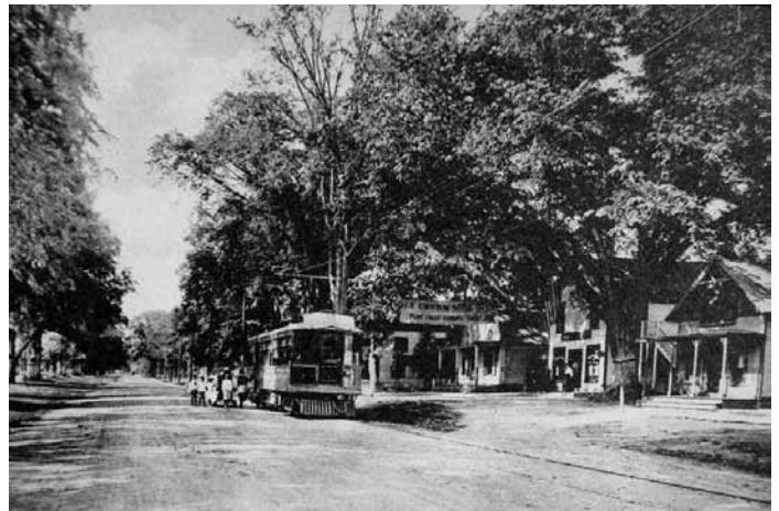
School children boarding trolley, Main St., 1910. Building which is now Esty's visible on right.

The cars were painted green and gold and had smoking and non-smoking sections. Fares ranged from 1 to 5 cents. Passengers were coastal commuters, school children, merchants and vacationers. In 1914 the line carried almost 20 million passengers. But the trolley line never made a profit. And in 1917 there was a terrible crash in Branford, killing several passengers, and sponsoring numerous lawsuits. Then in 1918, the wealthy investor and majority owner died. In 1919,